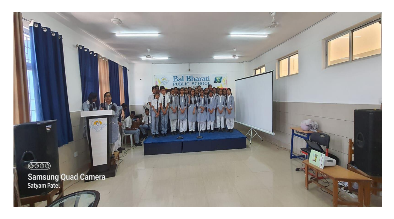
PPT Presentation - The Presentation was denoted to the great writers.

Group Song - The Group Song beautifully performed by students and song was related to the books.