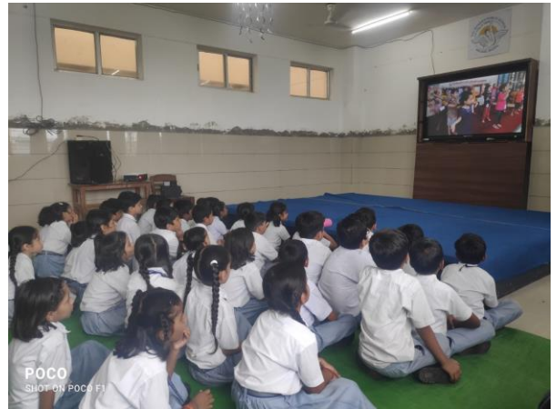
Screening of FLN Film Primary and Middle Segment