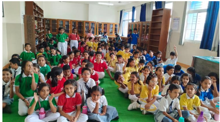
Story Weaving and Story Telling Sessions were conducted for the